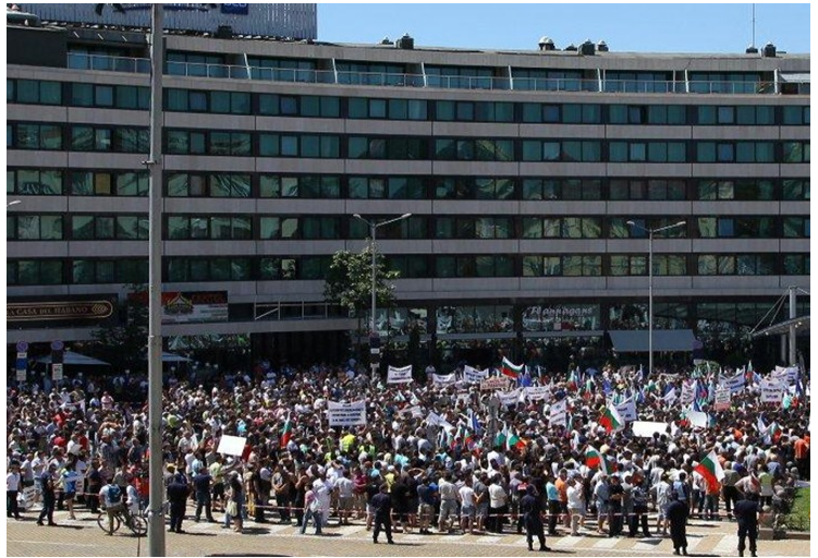
500 Bulgarian scrap metal dealers protested in Sofia at the proposed changes to scrap metal legislation

In the last three years, OSE has suffered over €12 million of damages and DEH over €2 million.