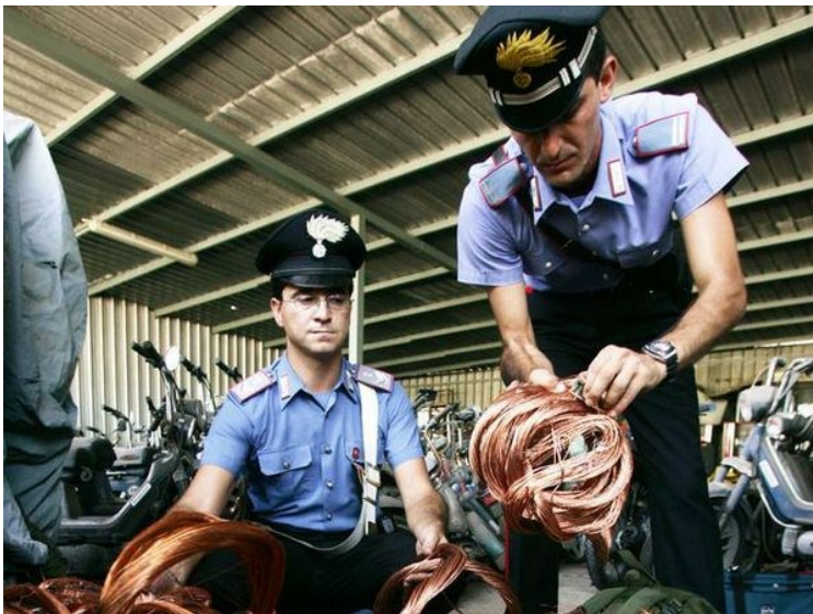
POLFER officers recovering stolen copper cable from a scrap metal dealer in Italy

PoI-PRIMETT plays a key role in encouraging collaboration between Italian public and private sectors and promoting an exchange of information and knowledge which is required to tackle metal theft.