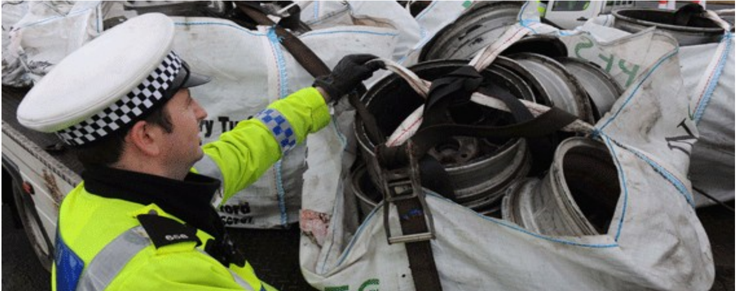
As the price of metal has risen, metal theft has increased across Europe

PoI-PRIMETT is a transnational public - private sector partnership, which aims to stimulate, promote and develop prevention and deterrence techniques as well as share information and good practice in the fight against metal theft.